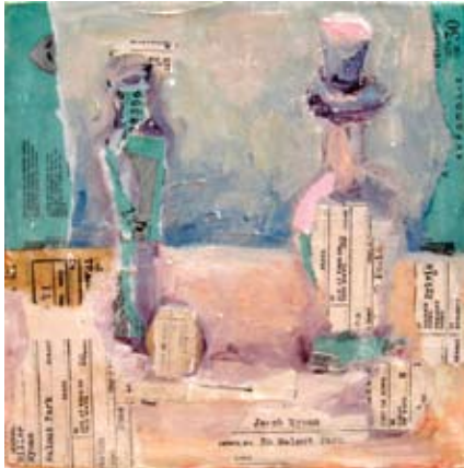
ABOVE Born In Brookline , 2008

In her portrait series, Brown connects to the universal human experience. The figurative pieces, like the landscapes, are not snapshots, but rather glimpses of a person's essence. The portraits are of individuals who have touched the artist's life and they convey complex relationships on formal, narrative, and interpersonal levels. The diptychs Dreaming of Dagny , Maybe Someday , and Many Blessings pair a still life of cut flowers with a memorial portrait. The cut flowers, with the brevity of their vitality, symbolize the fleeting and unpredictable nature of human life.