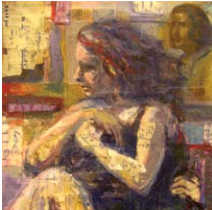
ABOVE Betrothed #4 , 2008