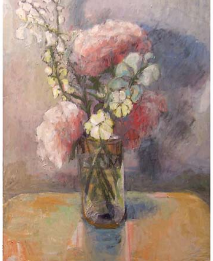
Many Blessings, 2007