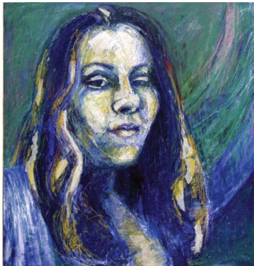
Dreaming of Dagny (diptych), 2008