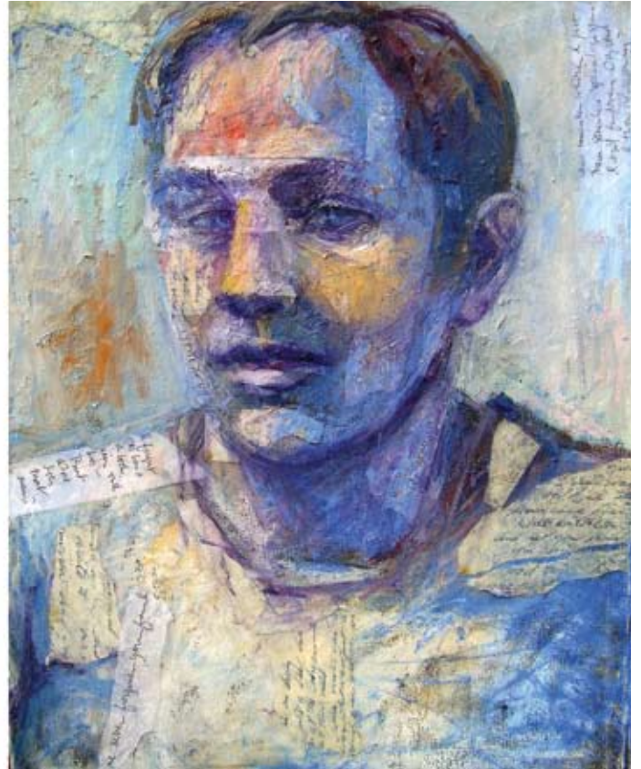
Last Look (diptych), 2007